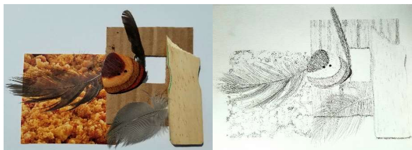
Project 2: Feathered Collage Texture

Collage was the subject for Project #2 which was translated to a pencil drawing focused on texture, space, and shape that was depicted within the collage. I found it difficult to express the subtle and complex textures of the 3-dimensional collage within the limits of a 2-dimensional drawing. Even so, the different textural elements within my collage were effectively rendered using a combination of lines, cross-hatching, stippling, and shading.