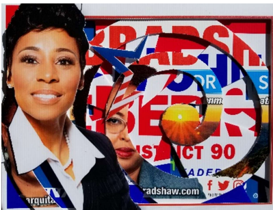
Project 4: Election 2020

For Project #4 (reductive, reveal), I built upon the artwork produced by Greely Myatt using road signs. However, I focused my project on political candidate signage. I cut different patterns (spiral, pie-shape, and rectangle) on these signs to reveal the deeper layers underneath within a 5-layer stack of signs. The resultant final project had considerable visual depth due to the thickness of each individual sign. Even though the uppermost signs depicted colorful scenes, including landscape and human portraits, most signs had a limited palette focused on 'patriotic' colors of red, white, and blue.